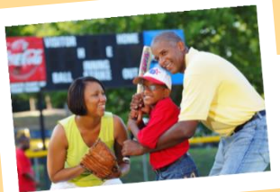
Bynum Family, Donor Family

AMAT makes a difference in multicultural communities by caring, showing compassion and shared responsibility to ensure that donated organs are recovered and transplanted to those most in need.